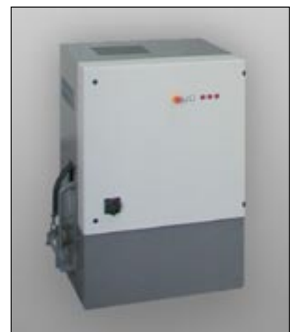
New hydraulic power pack