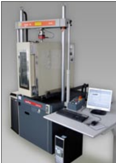
Zwick REL 2021 modernized