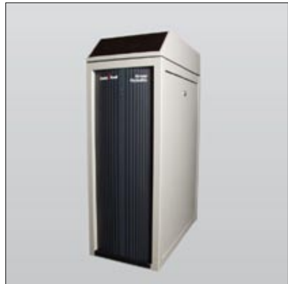
Zwick HydroWin 96XX Electronic