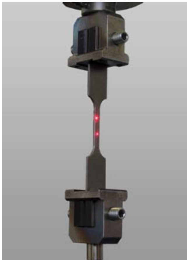
Typical high-speed testing assembly