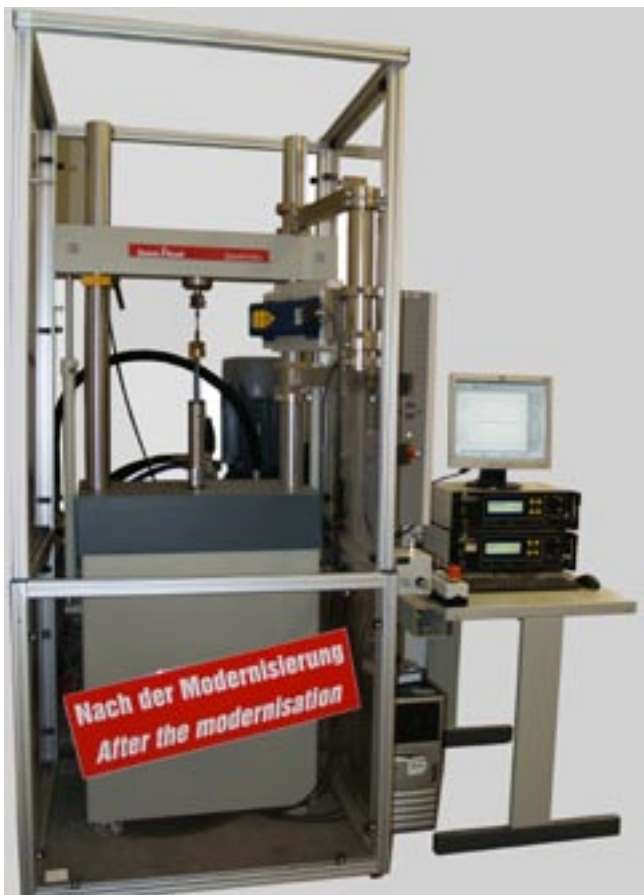
Modernized Schenck VHS 25/20