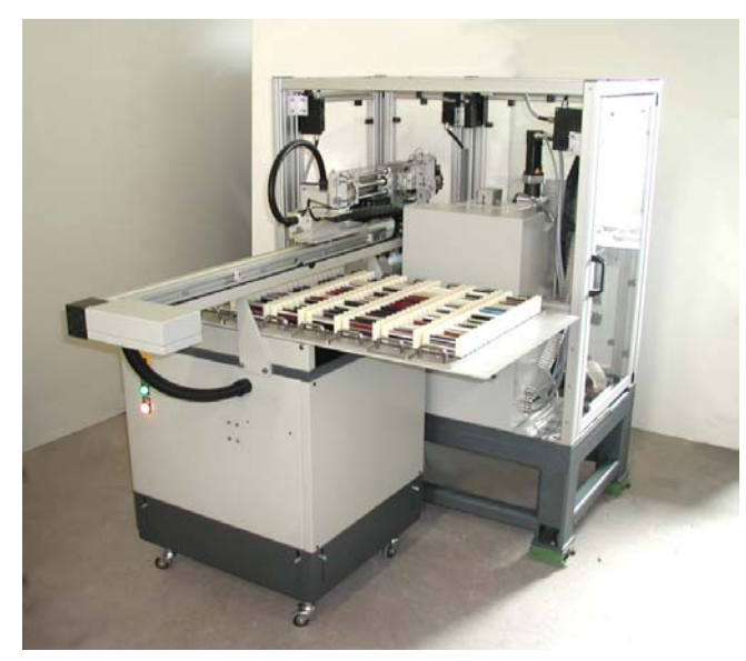
Pic 1: Complete view of the X-linear-system with notch milling machine